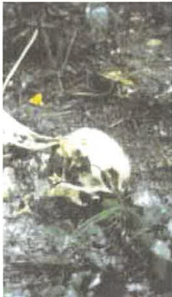
LEFT: Examples of two stages of human decomposition. The top photograph shows a male subject in active decay after 12 days. The lower photograph shows the same subject after 97 days in the dry stage of decomposition where only mummified skin remains. In temperate regions of the United States individuals can be completely skeletonized in 30–40 days in the summer.